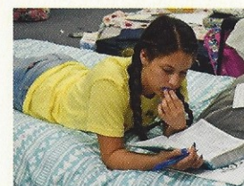
We give practical tools for success in ministry.

to EDUCATE the campers of the many different ways that they can serve in the church and to INSPIRE them to serve in these ways throughout their lives