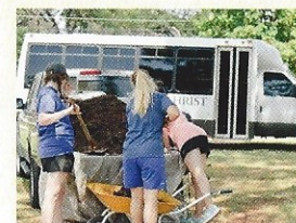
Our campers are challenged to use their skills and gifts.

To EQUIP the campers with tools needed to inspire and teach others about Christ