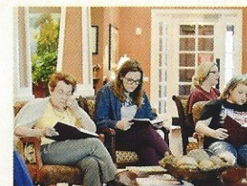
Every day is spent immersed in the Word of God.

to MENTOR and provide connections for the girls to succeed in their Christian walk