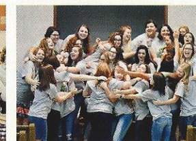
Our counselors invest deeply in our campers.