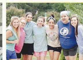
EWES Camp is a place where Christian friendships are made.