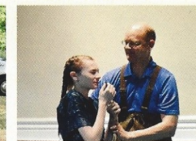
We provide a unique, spiritual atmosphere.